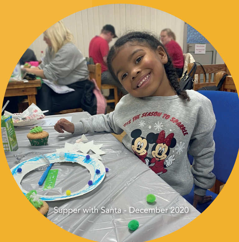
Supper with Santa - December 2020