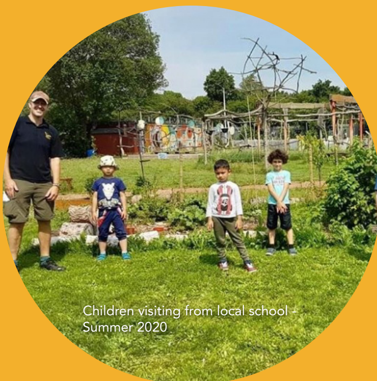
Children visiting from local school - Summer 2020

We also can't wait to get our music studio back up and running again, when the times allow. Our 'Inspire through Music' sessions give children the space - and time - to express their love of music. Our recent young participants have even been writing a rap about where they live, and how it makes them feel. We may decide to release a recording of this when it's ready, so watch this space.