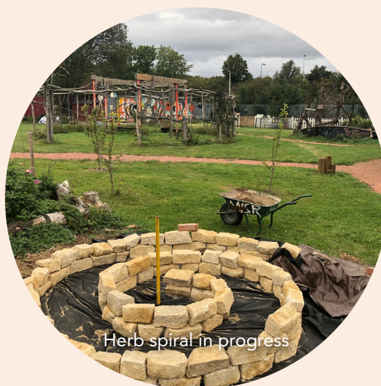
Herb spiral in progress