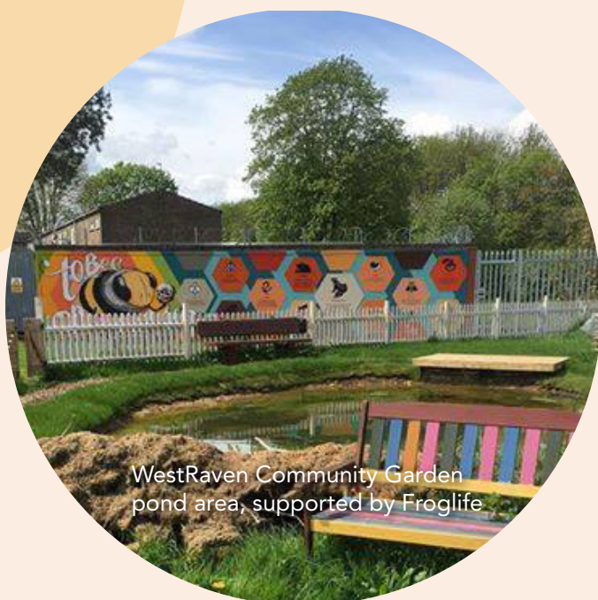
WestRaven Community Garden pond area, supported by Froglife

We recently had support from Cross Keys Homes for a project to build a herb spiral. This was for people looking for their next job opportunity. The project aimed to build people's skills and confidence. It also gave people a reference to use in job applications, and a talking point for job interviews. Since the project finished, one participant has gained employment. And another has started with The Prince's Trust.