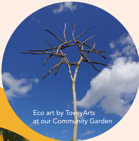
Eco art by ToveyArts at our Community Garden

Greetings from the WestRaven Community Café and Garden. And welcome to this first edition of our newsletter. We'll be taking a peek behind the scenes with our community teams, to give you a glimpse into our world.